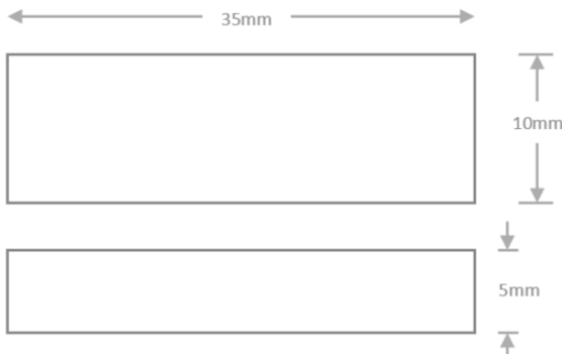
Dimensions stated in mm

* Prox 450 and Prox 200 are the same size.