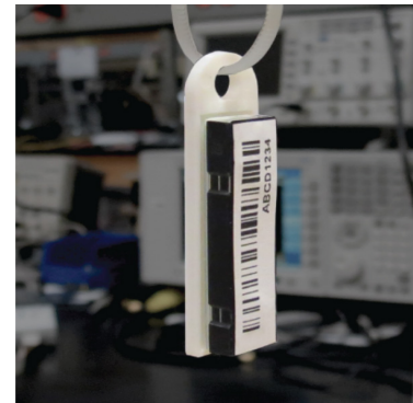
A white printable label will replace the standard black label when a printable label is required.

Authorized Reseller: RFID4U Store www.rfid4ustore.com 1-408-739-3500 sales@rfid4ustore.com